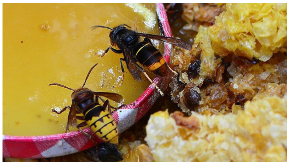
© Administration de la nature et des forêts

Read the text below, then answer the questions.